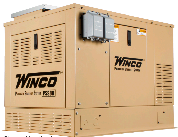
Shown with optional solar panel and receptacles.