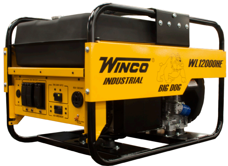
NEMA 5-20R 20A

12,000 Starting Watts 10,800 Running Watts