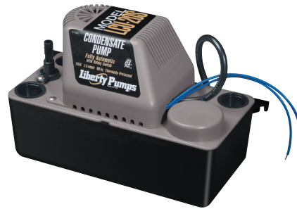
Model LCU-20S (115V) Model LCU-20ST (115V) Model LCU220S (230V) Model LCU220ST (230V)