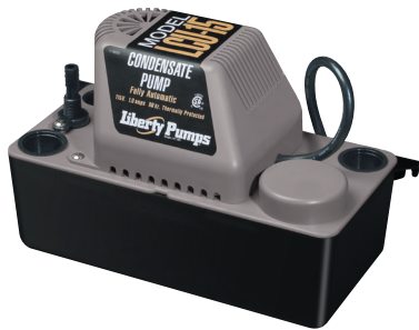
Model LCU-15 (115V) Model LCU-15S (115V) Model LCU-15T (115V) Model LCU-15ST (115V)