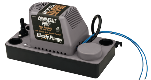
Shallow Pan Models: LCU-SP20S (115V) LCU-SP220S (230V)