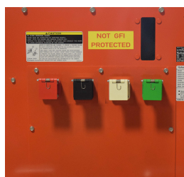
*Rear cam-lock connection option