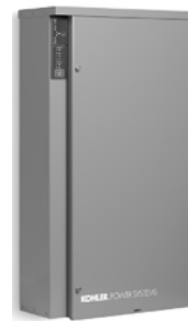
200 Amp with optional status indicator shown.