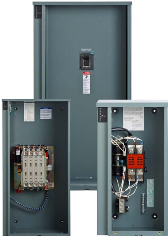
Covers have been removed for illustration.