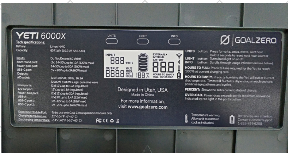
Figure 4 Battery label (标签图)