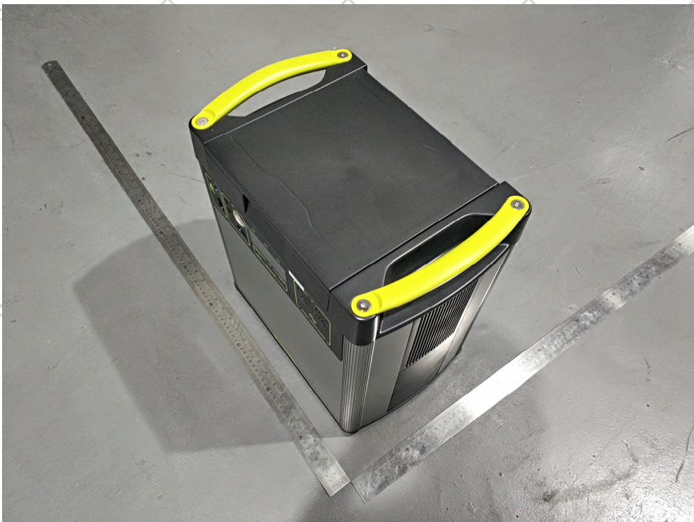
Figure 2 Overall view II of battery (外观图II)