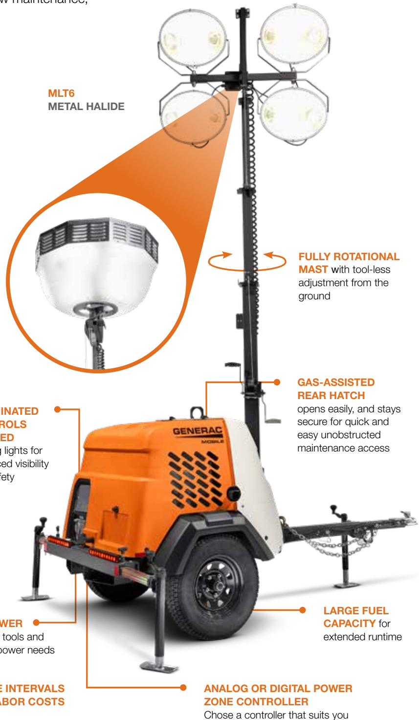
MLT6 METAL HALIDE

ILLUMINATED CONTROLS AND LED running lights for enhanced visibility and safety