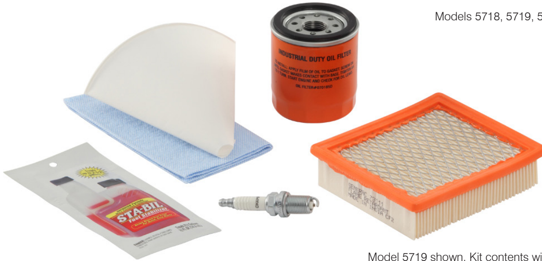
Model 5719 shown. Kit contents will vary by model.