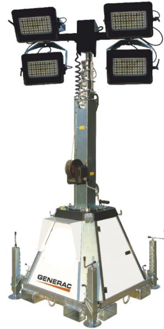
Lights forward @ 70-degree tilt Coverage @ 0.5 ft-c: 26,930 ft 2 (2,502 m 2 )