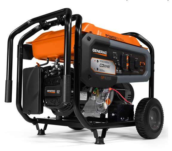
AC Rated Output Running Watts 8000 AC Maximum Output Starting Watts 10000