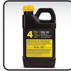
Engine Oil Included

N.W.: 119 lb. (54 kg) MEAS.: 26.3 in. X 24.8 in. X 22.9 in. 66.7 cm X 63.1 cm X 58.2 cm