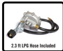
2.3 ft LPG Hose Included