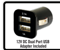
12V DC Dual Port USB Adapter Included