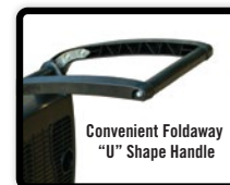
Convenient Foldaway "U" Shape Handle