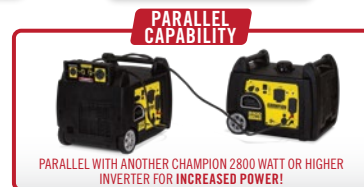
PARALLEL WITH ANOTHER CHAMPION 2800 WATT OR HIGHER INVERTER FOR INCREASED POWER!