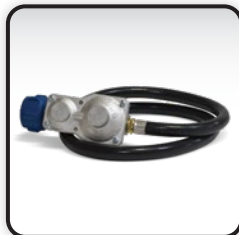
Propane Hose Included

N.W.: 162.5 lb. (73.7 kg) MEAS.: 27 in. X 27.7 in. X 24.4 in. 68.6 cm X 70.4 cm X 61.9 cm