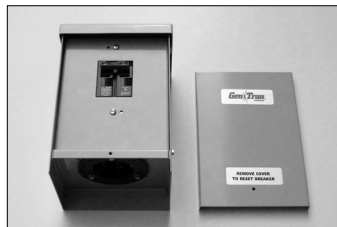
Model with Circuit Breaker