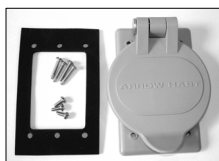
Optional Flip Lid Accessory keeps out nesting insects