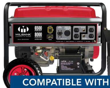
Milbank 6500 watt portable generator

*See back of flyer for features included in each package.