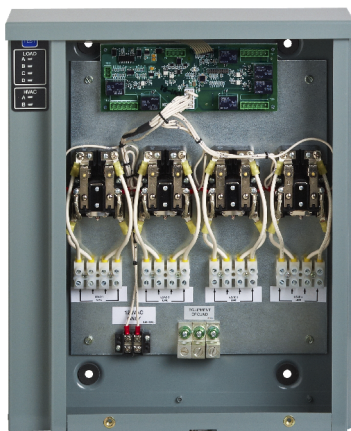
LCM with Terminal Block Connections