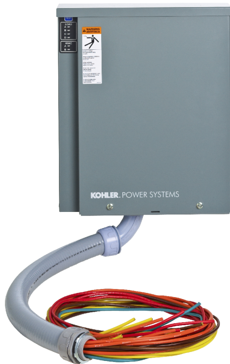
LCM with Pre-Wired Harness

ISO 9001 KOHLER POWER SYSTEMS NATIONALLY REGISTERED