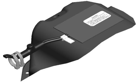
GM93357-KP2 Oil Pan Heater Kit, 240 VAC