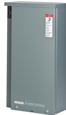
200 Amp with optional status indicator shown.