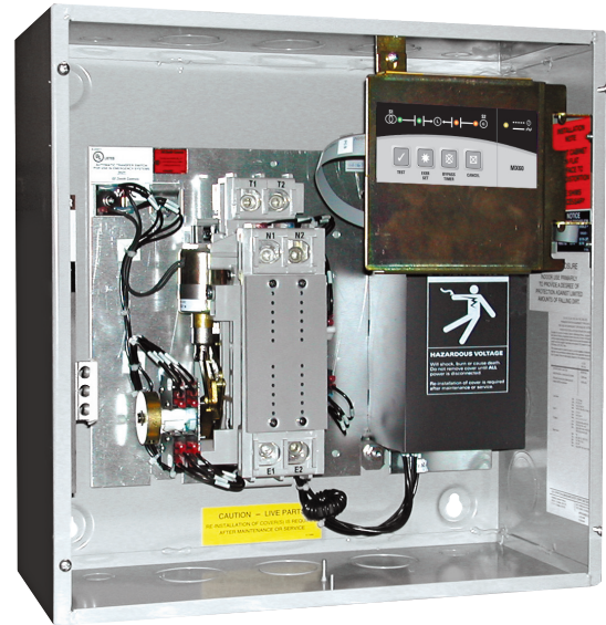
Zenith ZTX Series Small Frame Residential, Commercial & Light Industrial Switch with LED Control Panel (cover removed)

All time delays are fixed (non-adjustable).