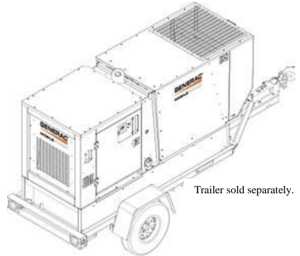
Trailer sold separately.