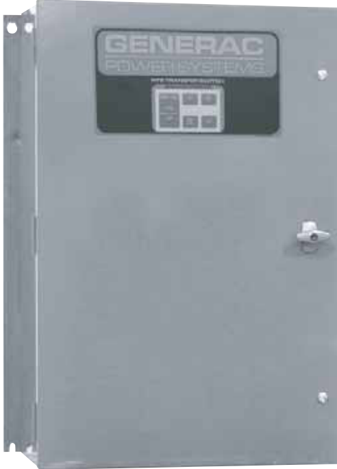
200 Amp HTS NEMA 1